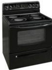
MODEL FEFL79DB BY FRIGIDAIRE

Power cord sold separately Cut-Out: 30 in. W x 36 in. H x 25 in. D; Before installing, consult installation instructions 5.4 cu. ft. Maxx Capacity™ self-cleaning oven with Auto-Latch™ safety lock EasySet™ 340 electronic oven control Seamless corners for easy cleaning Upswept cooktop design Hot surface indicator lights Storage drawer for added convenience SpeedBake™ convection cooking system Warm and Serve™ Zone Speed Boil Speed Clean